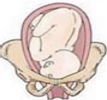
Right mentum posterior (RMP)