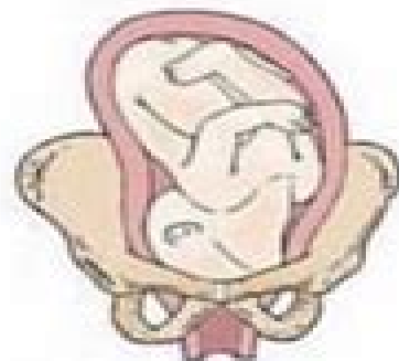
Left mentum anterior (LMA)