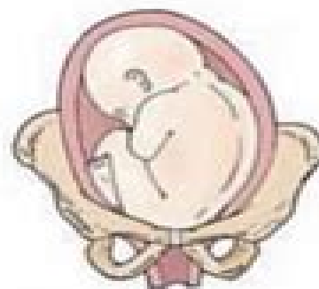
Left sacrum anterior (LSA)