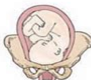
Left occiput posterior (LOP)