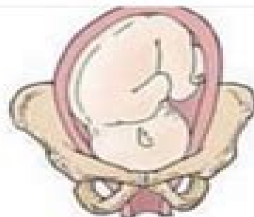
Right occiput transverse (ROT)