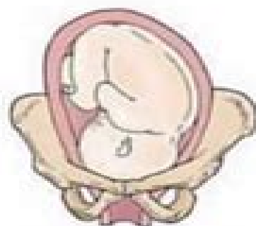
Left occiput transverse (LOT)