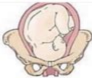
Right occiput anterior (ROA)