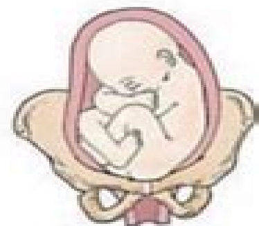
Left sacrum posterior (LSP)