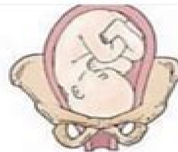
Right occiput posterior (ROP)