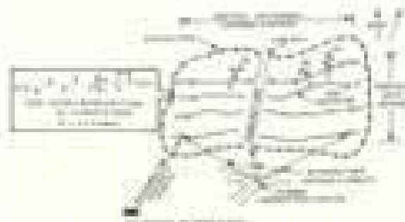
© 2006 The Authors Journal compilation © 2006 Blackwell Publishing Ltd

Received 12 October 1997; accepted 12 November 1997