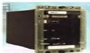
15. 偏置差动继电器 Biased Differential Relay Model : MBCH12 MBCH13