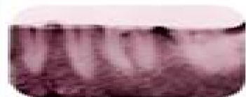
Figure 3.1 Missing images

Radiograph showing the result of partial emersion in developer.