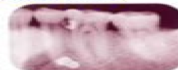
Figure 3.2 White marks

White blotches are caused by splashes of fixer on the film before processing.