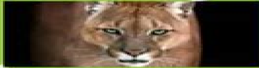
1. MOUNTAIN LIONS