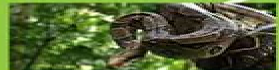
11. BOAS AND PYTHONS