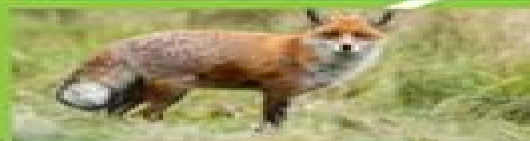
13. OTHER FOXES