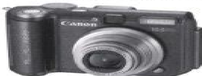
Foto de PowerShot A640