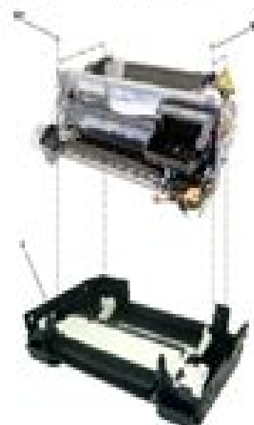
BOTTOM CASE UNIT