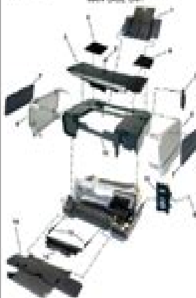
OPERATION PANEL UNIT & MAIN CASE UNIT