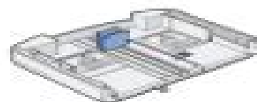
• Cassette extension