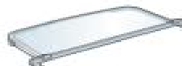
• Extension cover