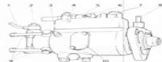
Fig. L3—On models equipped with C.A.V.-D.P.A. pump, loosen bleed screws 2, 3 and 4 in that order to bleed air from pump. Refer to text.