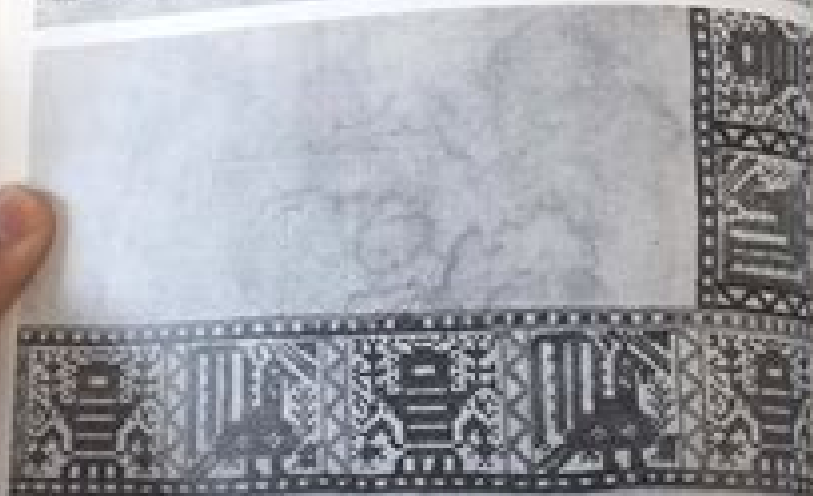
16. Border from a cushion cover. Dakshinam, 7 th Cen. Silk on linen, cross and lay-stitch. Red, green, blue and yellow. 42 x 22 cm. 7.2.1939