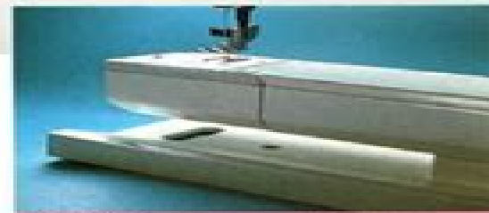
FREE ARM Converts to two sizes. I use the standard