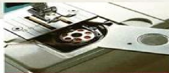
DROP-IN BOBBIN No bobbin case. The bobbin is