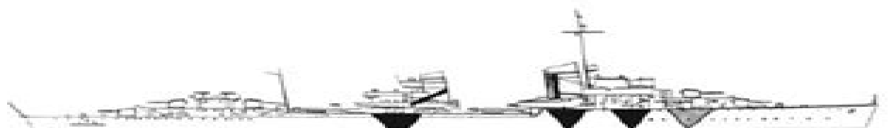
Z 14 Friedrich Ihn , 1942