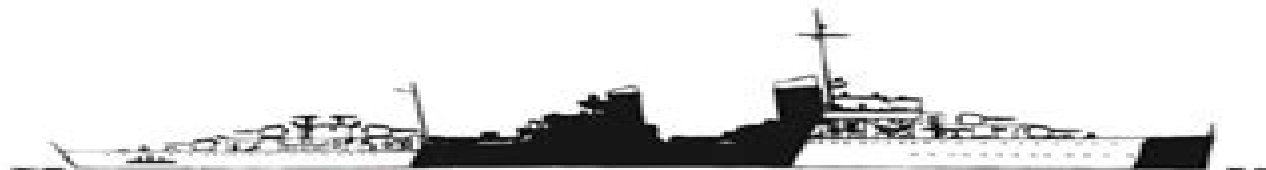
Z 7 Hermann Schoemann , 1942 (port side similar)