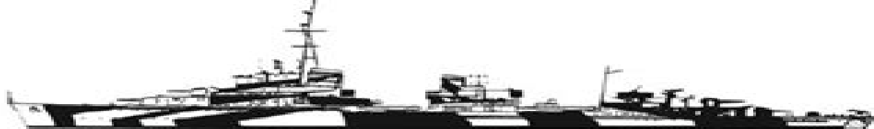
Z 6 Theodor Riedel , 1942