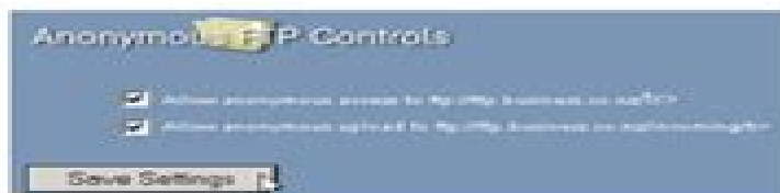
Figure 3.29: Setting Anonymous FTP access