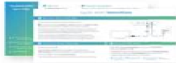
Quick start instructions, Troubleshooting tips & FAQs