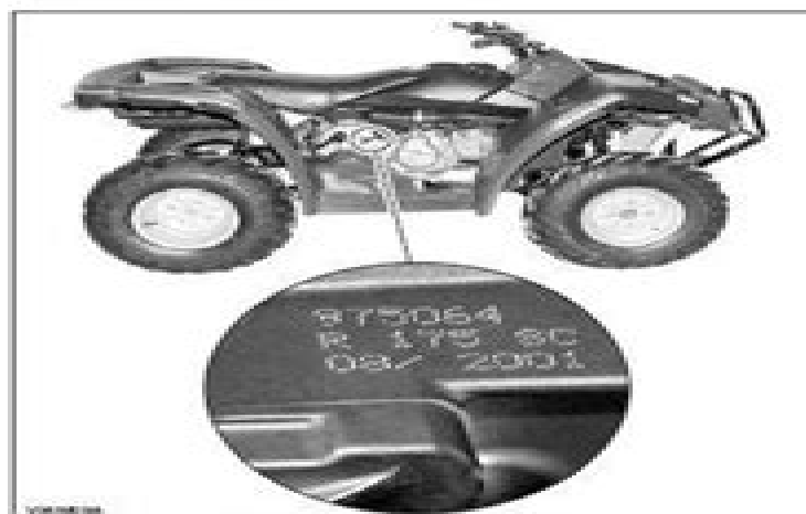
E.I.N. (ENGINE IDENTIFICATION NUMBER)