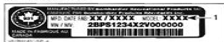
TYPICAL — VEHICLE IDENTIFICATION NUMBER LABEL 1. Model number