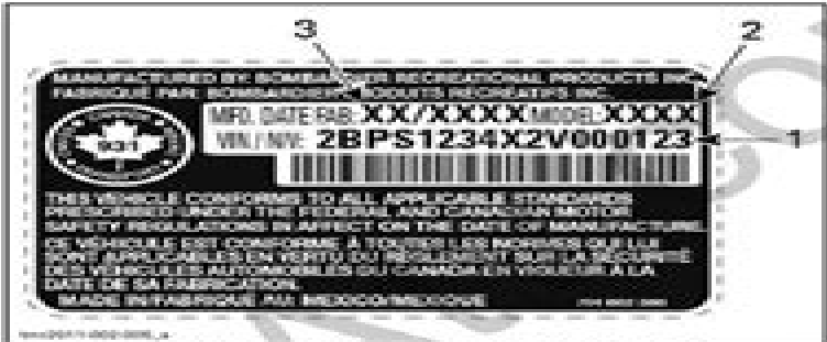
TYPICAL — VEHICLE IDENTIFICATION NUMBER LABEL

The VIN (Vehicle Identification Number) decal is located under the glove box on the passenger side.