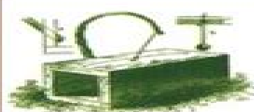
double box snare