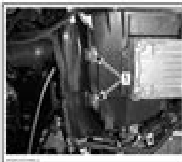
Air filter housing 1. LH air filter screws