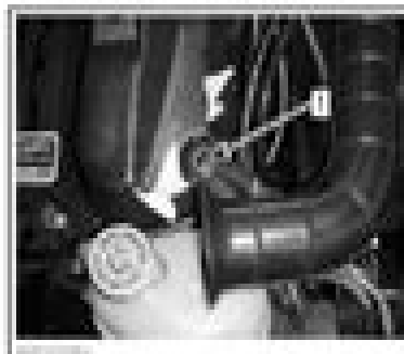
Air intake tube retaining screw 1. Air intake tube retaining screw