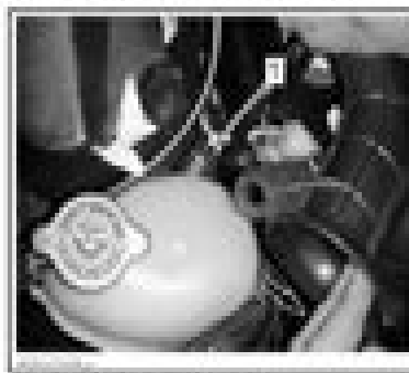
Coil-over fan assembly for cooling 1. LH coolant tank retaining screws