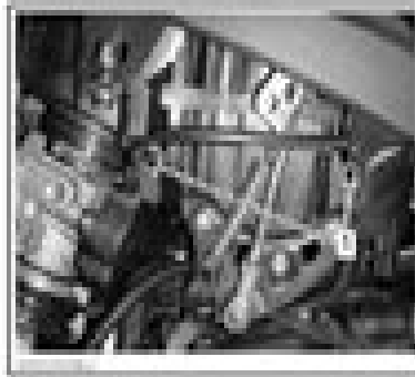
Locking link to remove 1. Locking link to remove