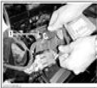
Engine harness connectors (PBC) 1. Engine harness connectors (PBC)