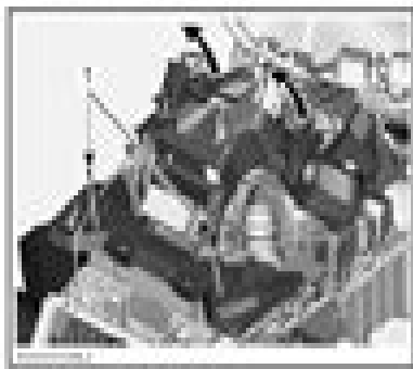
Dashboard support retaining screws 1. Screws to remove