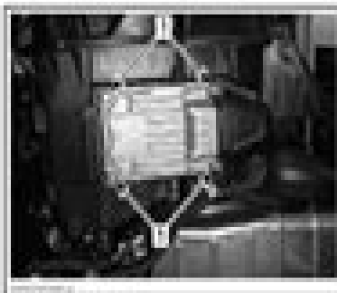
ECM retaining screws 1. ECM retaining screws