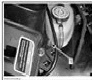
Coil-over fan assembly for cooling 1. Coolant tank retaining screws