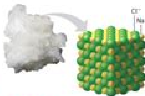
Figure 2.7B A crystal of sodium chloride

The environment affects the strength of ionic bonds. In a dry salt crystal, the bonds are so strong that it takes a hammer and chisel to break enough of them to crack the crystal. If the same salt crystal is placed in water, however, the ionic bonds break when the ions interact with water molecules and the salt dissolves, as we'll discuss in Module 2.13. Most drugs are manufactured as salts because they are quite stable when dry but can dissolve easily in water.