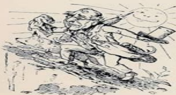
JAN. 1st.—COLD WINDS AND HARD FROST.