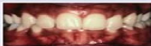
Fig. 7a A case with a deep bite and retroclined upper incisors