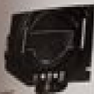
Sync. Contact for Flash Unit