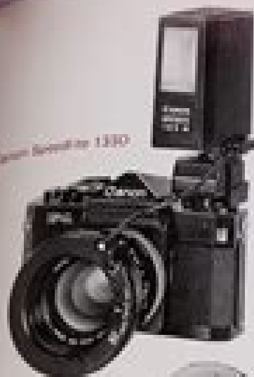
Canon Speedlite 133D