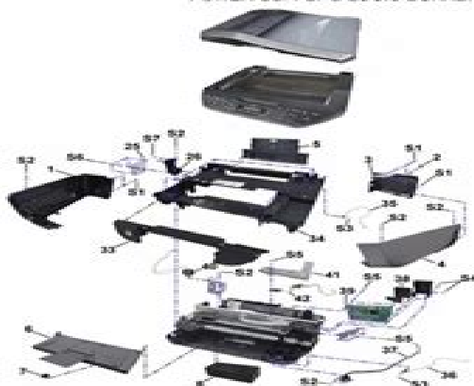
EXTERNAL PARTS POWER SUPPLY & LOGIC BOARD.