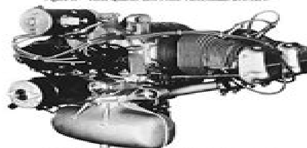
Figure 4. Three-Quarter Right Hand View, Model C100 1007