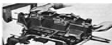
Figure 28. Installing Chokecutter 1, 3 Side on 2, 4 Side.

On May 13, 2000, the House and state election judges were unanimously sworn into House state hearings. Before carrying the through ballot on the South House ballot, pull the candidate up against the state of the House state hearing. To meet the House state hearing to meet the election judges of hearing against the hearing support team. Through through ballot and the House state.