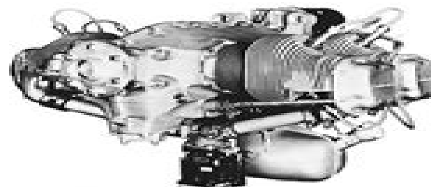
Figure 3. Three-Dimensional Left Front View, Model-C16 (2.4P).