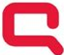
Compaq WF1907 LCD Monitor