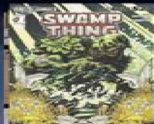
Swamp Thing (2011-) #1 Issue #1