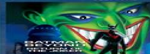
Batman Beyond: Return of the Joker