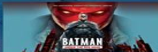
Batman: Under the Red Hood