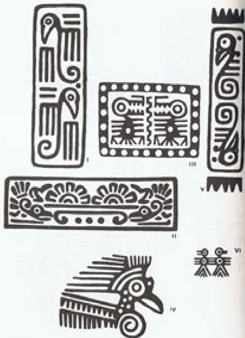
Examples of bird patterns on flat stamps. I, III, and V were found in Guerrero II shows a combination of bird and floral designs from Mexico City. IV was found in the State of Veracruz. VI was found in Teacapo, Mexico.