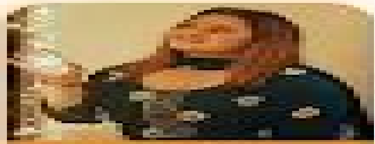
Devī Kahanīya Story 6