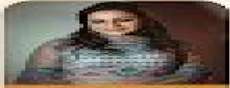
Devī Kahanīya Story 4