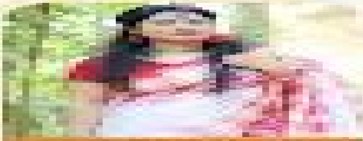
Devī Kahanīya Story 5