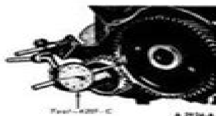
FIG. 15—Checking Timing Gear Runout

backlash between the camshaft gear and the crankshaft gear with a dial indicator. Hold the gear firmly against the block while making the check. Refer to specifications for the backlash limits.