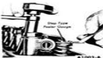
FIG. 17—Typical Valve Clearance Adjustment—401, 477 and 534 SD Engines