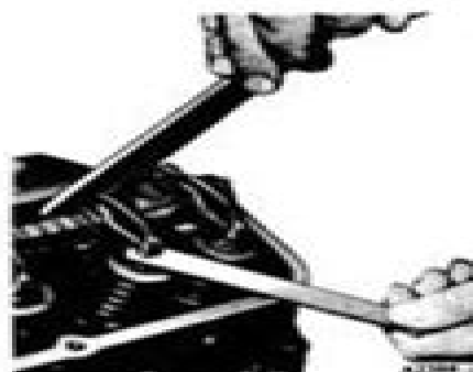
FIG. 18—Checking Valve Clearance—Hydraulic Valve Lifters

terminal) at the starter relay. Install an auxiliary starter switch between the battery and 5 terminals of the starter relay. Crank the engine with the ignition switch OFF.