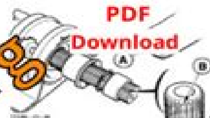
Fig. 19. Rear axle driveshaft disconnected. A - Double groove B - Rear axle

Attach the driveshaft to the transmission output flange using the nuts. Attach the driveshaft to the rear axle and secure the driveshaft secure bearing to the rear assembly, Fig. 19.