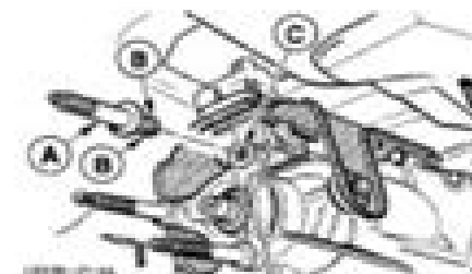
Fig. 20. Transmission output flange with studs.