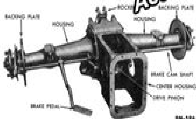
Fig. 32—Rear Axle Assembly

Lift the axle shafts from the axle housing. Remove the cap screws that secure the left-hand axle housing to the center housing, and remove the axle housing. Lift the differential from the center housing (fig. 35). Remove the right-hand axle housing from the center housing.