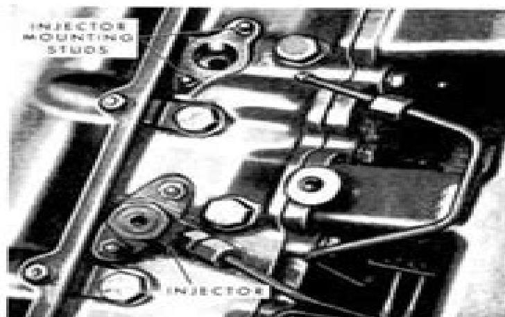
Figure 7 Diesel Engine Injector Removed