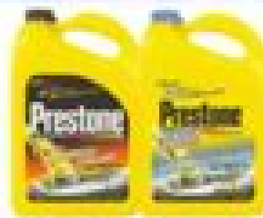
Prestone® Extended Life/ Prestone® 50/50 Extended Life Antifreeze & Coolant

NAP100T1 NAP100L1 NAP100T1C01 NAP100L1C01