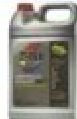
Zerex® Extreme Life Antifreeze & Coolant