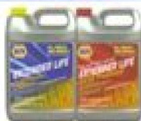
NAPA® Extended Life/ NAPA® 50/50 Extended Life Antifreeze & Coolant

NAP100T1 NAP100L1 NAP100T1C01 NAP100L1C01