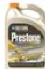
Prestone® 5/150 Antifreeze & Coolant