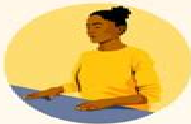
'Do nothing' meditation