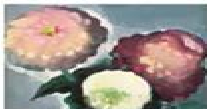
3 Zinnias, 1921 Georgia O'Keeffe Museum