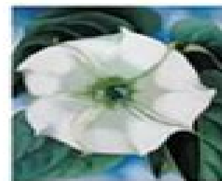
Jimson Weed, 1932 Georgia O'Keeffe Museum

Best known for her intimate images of flowers and love for New Mexico's badlands, Georgia O'Keeffe (American, 1887-1986) became the first American woman to earn popular and critical worldwide acclaim for her paintings, which shunned the European aesthetic she found so constraining. Voluptuous petals and other natural forms painted with vibrant simplicity characterized O'Keeffe's long career that placed her at the center of American modernism.