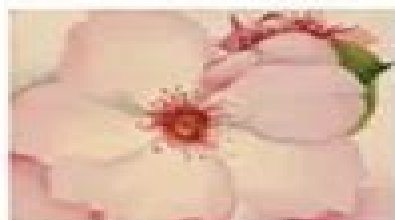
Rose, c. 1957 Georgia O'Keeffe Museum