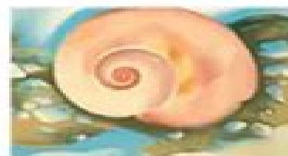
Pink Shell with Seaweed, c. 1938 San Diego Museum of Art

Front Cover: Yellow Curls, 1926 Smithsonian American Art Museum