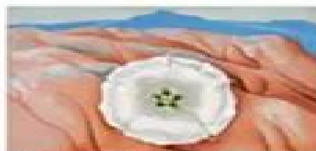
Datura and Pedernel, 1940 Orlando Museum of Art, Orlando, Florida