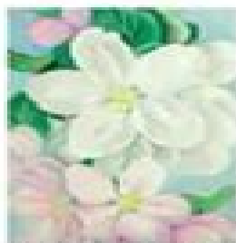
Apple Blossoms, 1930 The Nelson-Atkins Museum of Art, Kansas City, Missouri