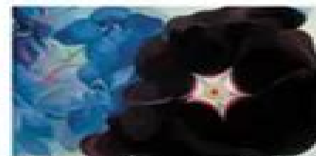
Black Hollyhock Blue Larkspur, 1930 Georgia O'Keeffe Museum