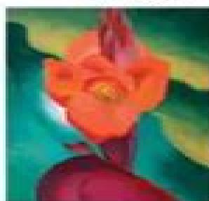
Red Canna, 1919 High Museum of Art, Atlanta