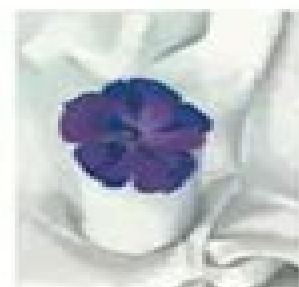
Petunia, 1925 San Francisco Museum of Modern Art