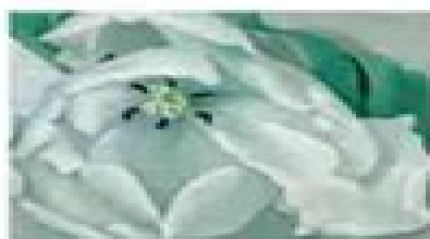
White Flower, 1932 The Muscarelle Museum of Art at the College of William & Mary in Virginia