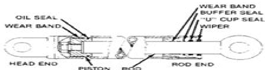
Basic Hydraulic Cylinder

The piston is secured to the rod with a bolt and washer. The piston incorporates wear band and oil seal.