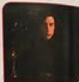
1 Kylo Ren, the TIE Silencer's master. The cockpit is a naturally defined space.