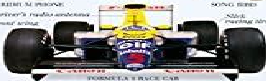
FORMULA 1 RACE CAR