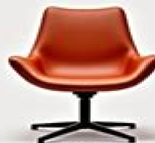
B1/01 50 Black / Orange leather