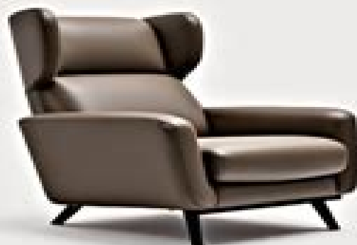
BAC 00 Black / Brown leather