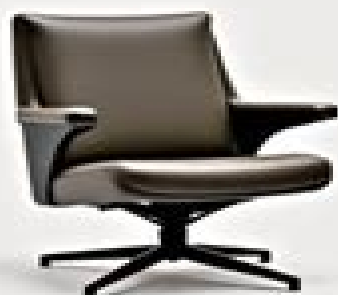
B41 532 Orange / Brown leather