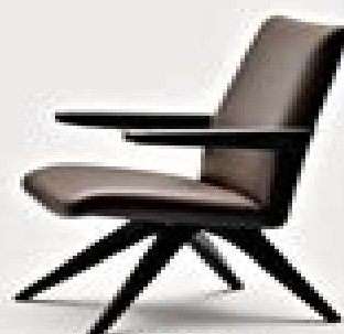
TIG 2A1 31 Black / Brown leather