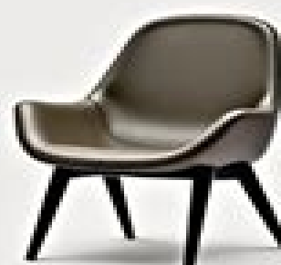
FANG 0053 Black / Brown leather / Black / Brown leather