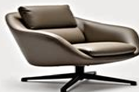
B03 371 Black / Brown leather