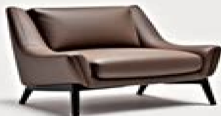
BAC 3DNCA Black / Brown leather