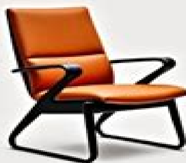
BAC 34 Black / Orange leather