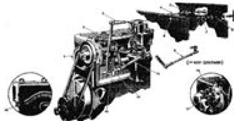
FIG. 34—GOVERNOR INSTALLATION AND ADJUSTMENT

In the absence of electrical tachometer equipment, engine speed may be determined by the speedometer. Safely jack up the rear wheels and be sure the front wheel drive is not engaged. When driving the rear wheels in high or direct transmission gear, the speedometer will read from 13½ to 15 miles per hour (22 to 24 Km. h.) at an engine speed of from 900 to 1000 rpm.