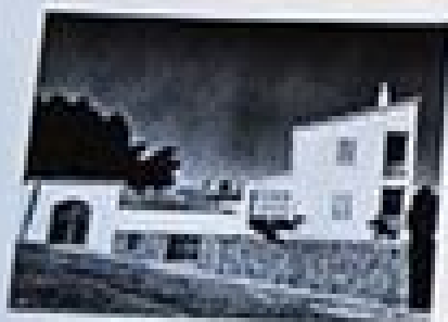
Architectural drawing from [illegible] 1911