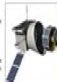
MESSENGER spacecraft in orbit around Mercury.

Mercury is the only planet in the Solar System that has a permanent magnetic field. It is also the only planet in the Solar System that has a thin atmosphere.