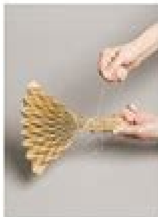
10.10.10 Modeling energy efficiency with nonlinear models In a previous paper, we used a nonlinear model to model energy efficiency. The model was based on the following equation: