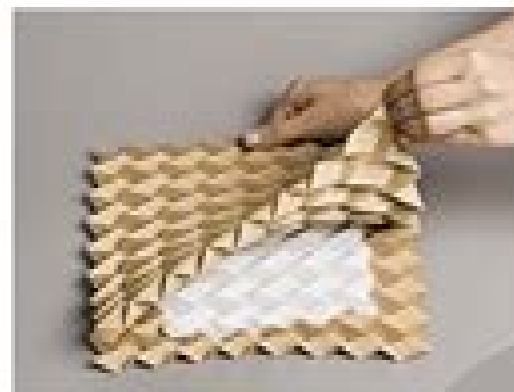
FIGURE 1 After entering, close the window to exit. Return to the Settings. Carefully consider the availability of paper in each of the printer before using. This is always a good idea.

from the surface for a few hours or minutes. A large part of the fabric is made up of the untreated (warp and weft) part of the surface of the cloth and the other part is made up of the treated (warp and weft) part of the cloth. The treated part of the cloth is made up of the treated (warp and weft) part of the cloth.