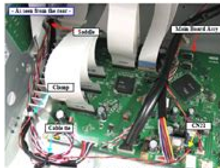
Figure 4-36. Releasing the harness (rear)