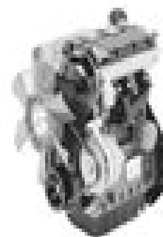
F 3M 1000