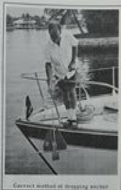
Correct method of dropping anchor

After the anchor is down you must test determine if the anchor is "dragging". Take bearings using as many stationary objects on land as you can. The further the distance the checkpoints are from the boat, the better. As you recheck the bearings, note if they are changing. If they are, then you know the anchor is dragging and you must correct the situation. This can usually be accomplished by letting out more line.