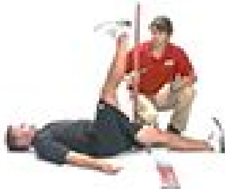
5. Leg Raising