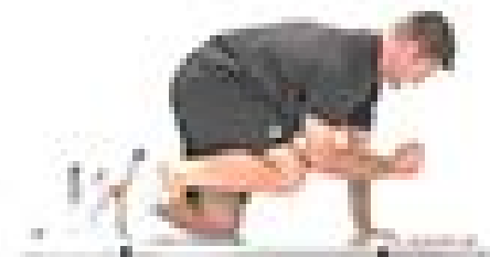
7. Rotary Stability