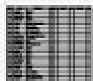
Fig. 014 CYLINDER HEAD & BONNET