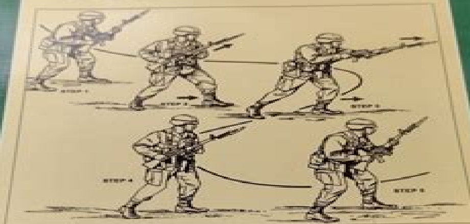
Figure 7-12. Thrust movement.

FM 3-25.150 (FM 21-50) Headquarters Department of the Army